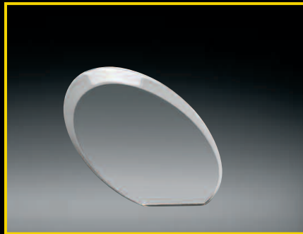
85104 4" (5-AA15-9)

PDU adds another unique shape to the 3/4" acrylic figure line. The Slanted Oval is offered in three sizes and two finishes of clear and jade. Select the Slanted Oval that is ideal for your customer. These awards can be laser engraved or sand blasted.