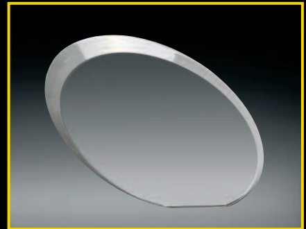
85106 6" (5-AA19-9)