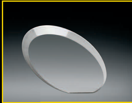
85105 5" (5-AA17-9)