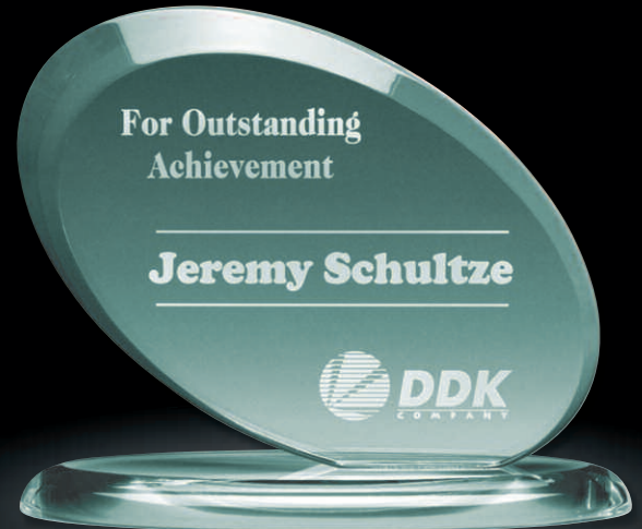
85105-J SHOWN WITH 41625-J BASE, SOLD SEPARATELY.)